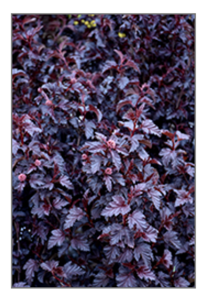
Panther Ninebark foliage