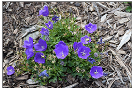
Pearl Deep Blue Bellflower in bloom