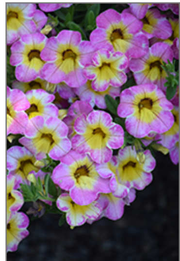
Cha-Cha Diva Hot Pink Calibrachoa flowers