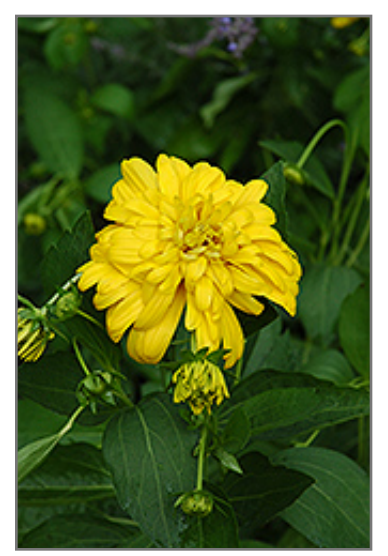
Goldquelle Coneflower flowers