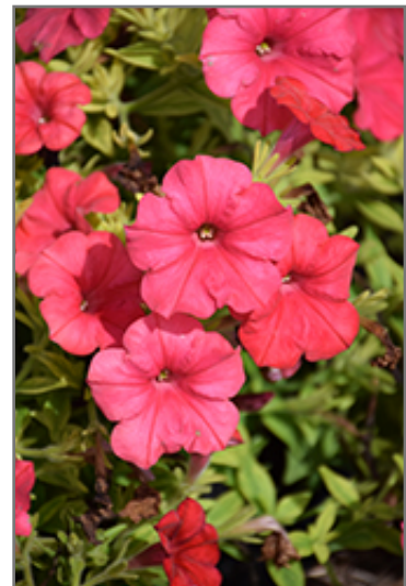
ColorRush Watermelon Red Petunia flowers