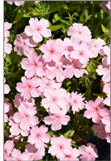
Gisele Light Pink Phlox flowers

Gisele Light Pink Phlox is recommended for the following landscape applications;