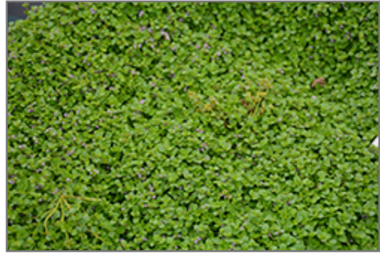
Mini Mint Ornamental Mint

Mini Mint Ornamental Mint is recommended for the following landscape applications;