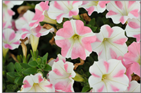
Surfinia Heartbeat Petunia flowers

This plant will require occasional maintenance and upkeep. Trim off the flower heads after they fade and die to encourage more blooms late into the season. It is a good choice for attracting butterflies and hummingbirds to your yard, but is not particularly attractive to deer who tend to leave it alone in favor of tastier treats. It has no significant negative characteristics.