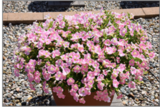
Surfinia Heartbeat Petunia in bloom

Surfinia Heartbeat Petunia is a fine choice for the garden, but it is also a good selection for planting in outdoor containers and hanging baskets. Because of its trailing habit of growth, it is ideally suited for use as a 'spiller' in the 'spiller-thriller-filler' container combination; plant it near the edges where it can spill gracefully over the pot. Note that when growing plants in outdoor containers and baskets, they may require more frequent waterings than they would in the yard or garden.