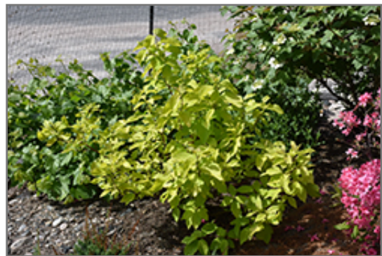
Neon Burst Dogwood