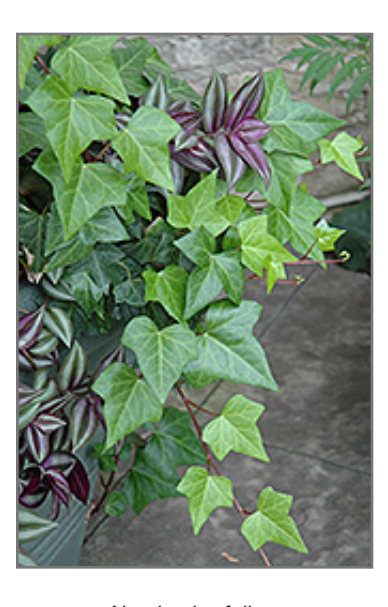
Algerian Ivy foliage

When grown indoors, Algerian Ivy can be expected to grow to be about 10 feet tall at maturity, with a spread of 3 feet. It grows at a fast rate, and under ideal conditions can be expected to live for approximately 30 years. This houseplant performs well in both bright or indirect sunlight and strong artificial light, and can therefore be situated in almost any well-lit room or location. It is very adaptable to both dry and moist soil, and should do just fine under average home conditions. The surface of the soil shouldn't be allowed to dry out completely, and so you should expect to water this plant once and possibly even twice each week. Be aware that your particular watering schedule may vary depending on its location in the room, the pot size, plant size and other conditions; if in doubt, ask one of our experts in the store for advice. It is not particular as to soil pH, but grows best in rich soil. Contact the store for specific recommendations on pre-mixed potting soil for this plant. Be warned that parts of this plant are known to be toxic to humans and animals, so special care should be exercised if growing it around children and pets.