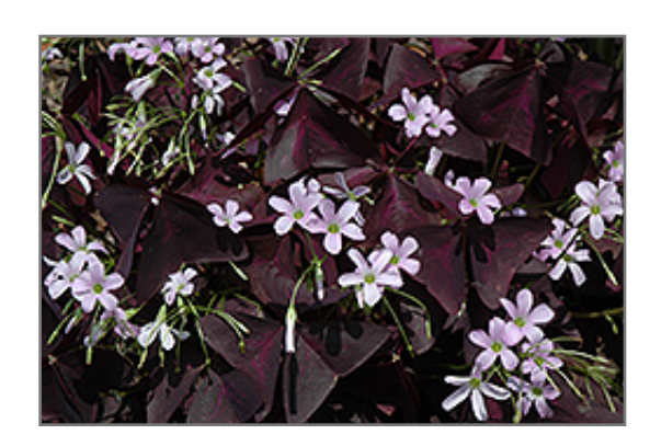
Purple Shamrock flowers