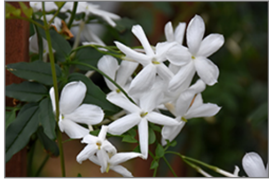
Climbing Jasmine flowers

This is a dense multi-stemmed evergreen houseplant with a spreading, ground-hugging habit of growth. This plant may benefit from an occasional pruning to look its best.