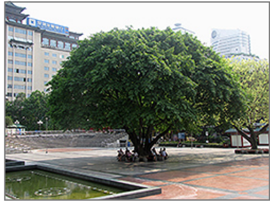
Indian Laurel Fig

This is a multi-stemmed evergreen houseplant with a more or less rounded form. This plant may benefit from an occasional pruning to look its best.