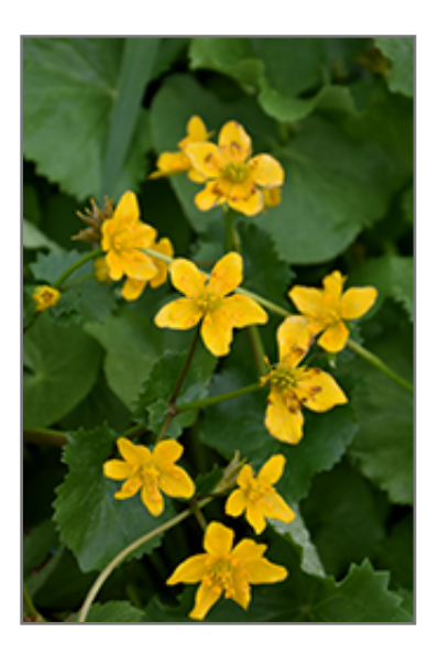
Marsh Marigold flowers