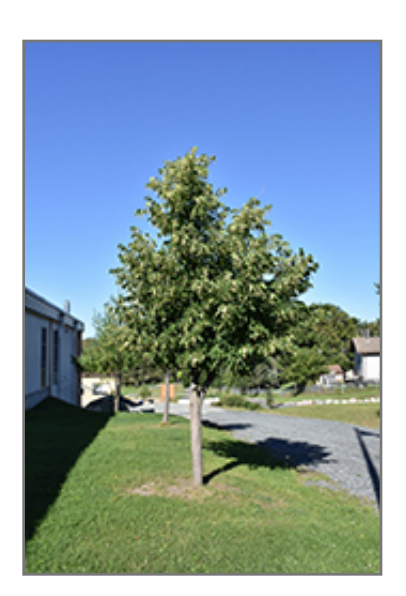
Lone Star Linden