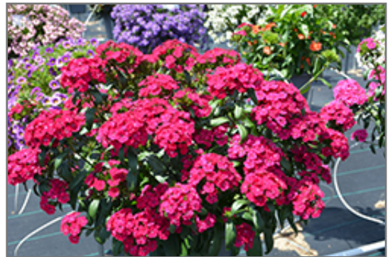
Jolt Cherry Hybrid Pinks in bloom