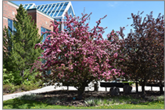
Makamik Flowering Crab in bloom

Makamik Flowering Crab is recommended for the following landscape applications;