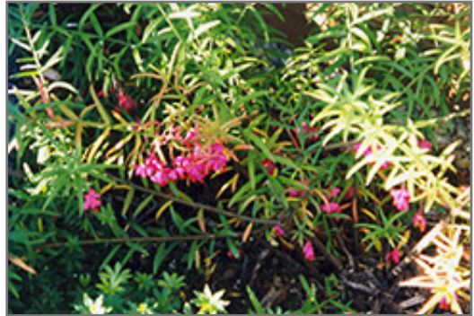
Dwarf Turkestan Burning Bush flowers

* This is a 'special order' plant - contact store for details