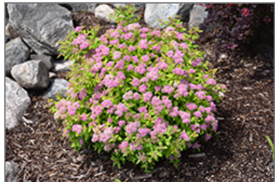
Dakota Goldcharm Spirea in bloom