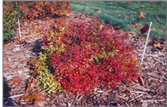
Dakota Goldcharm Spirea in fall

* This is a 'special order' plant - contact store for details