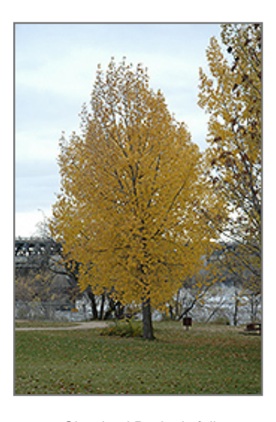
Siouxland Poplar in fall