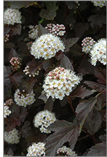
Diablo Ninebark flowers

Diablo Ninebark is recommended for the following landscape applications;